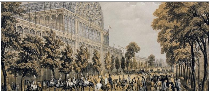
The Great Exhibition